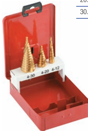
Step Drill, TiN Spiral Flute Set – 2602-S1