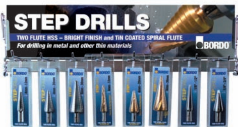
Step Drill Merchandiser, 8 Piece – 2602-D2