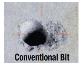
Deltagon SDS-Plus Masonry Bits minimise bit walk during hole starting.

Contact Bordo International for further information