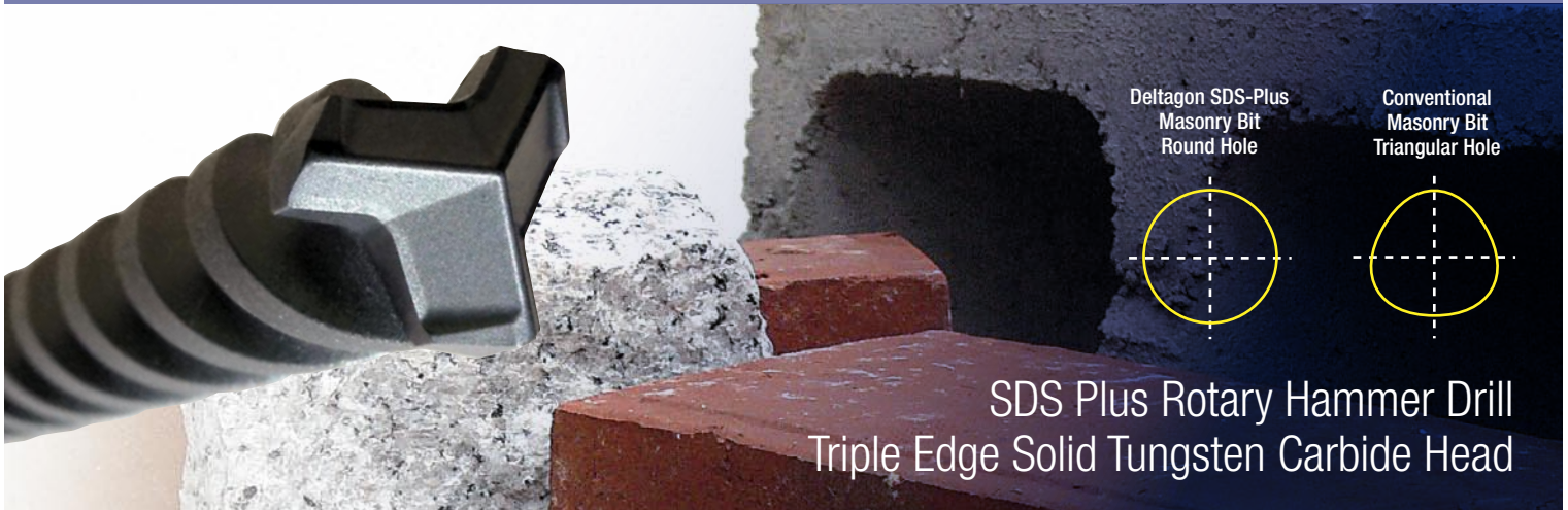
SDS Plus Rotary Hammer Drill Triple Edge Solid Tungsten Carbide Head